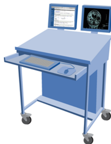
Figure 1. The mobile point-of-care system provides wireless access to digital images and other hospital information systems.

Having identified the components of the mobile point-of-care system, the consultants proceeded with a pilot test. First, all of the necessary equipment was configured in an Intel® Solution Centre lab in Sydney. Once the system was tested for functionality there, it was moved to a lab at The Alfred, where it was tested alongside other hospital equipment to ensure there would be no interference between systems.